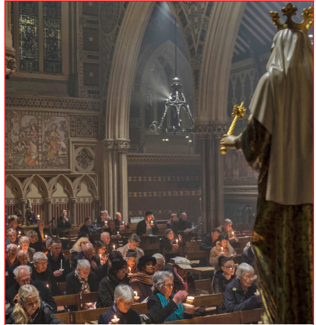
Candle-lit worshippers at an All Saints' Carol Service, December 2016

Regular readers of this Parish Paper and regular worshippers at All Saints will be aware that, at a time when the number of rough sleepers on the streets of London have reached new heights, we have found ourselves becoming a "day shelter". Churches like ours which are open all day have always been places where those