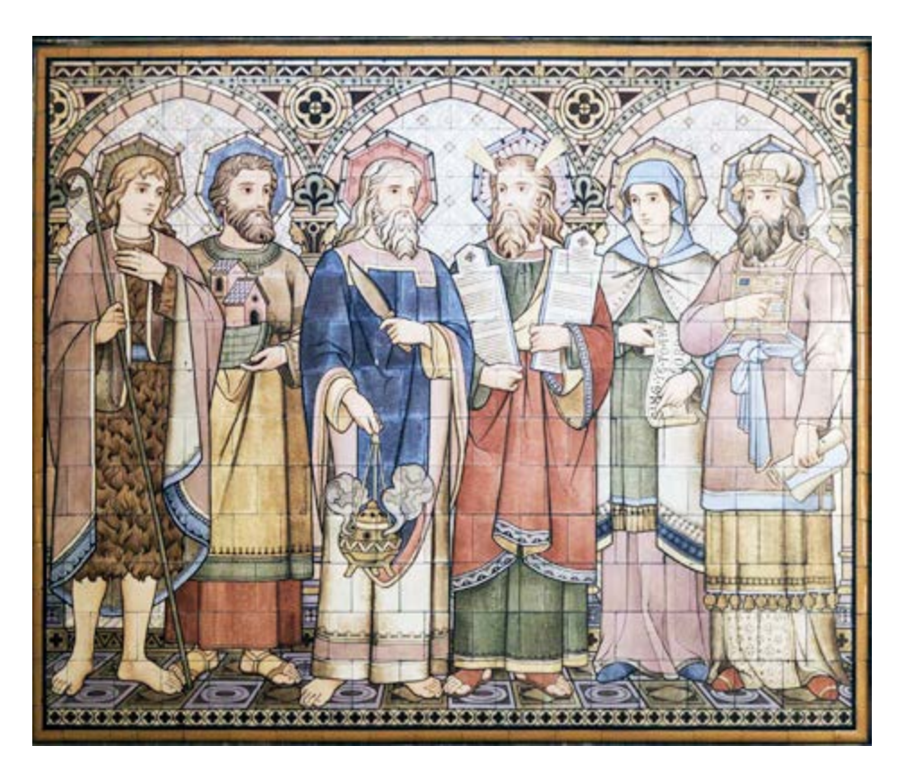
Tile Painting from the north wall of All Saints, 1873. Designed by William Butterfield, these tiles replaced his original geometrical decoration on the wall. The figures featured are: Abel, Noah, Abraham, Moses, Miriam and Aaron.

"If it comes to pass, it is for us the end of the world; for the world which we have known will pass away."